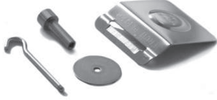
Wagner Model FT Accessories