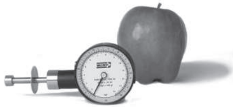
Wagner Fruit Test™ Model FT