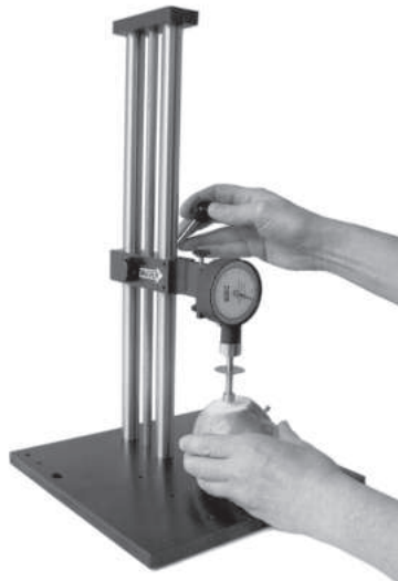
FT shown mounted on FTK Test Stand