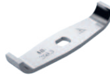
MI 250.3 Beater, hard metal For harder materials up to Mohs hardness 9 Ident. No. 0025003953