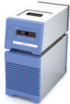
RC 2 basic Recirculating chiller Ident. No. 0004171000