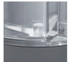
MultiDrive BL 2000 Vessel with cutter