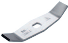
MI 250.1 Beater, stainless steel For hard, brittle materials up to Mohs hardness 5 Ident. No. 0025003993