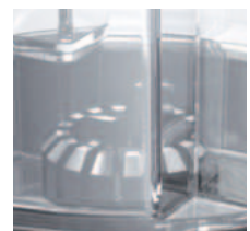
MultiDrive DI 2000 T Vessel with dispersing element