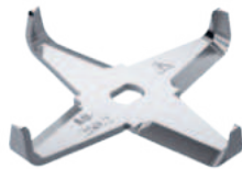
MI 250.2 Star-shaped cutter, stainless steel For fibrous materials such as paper and plant Ident. No. 0025003951